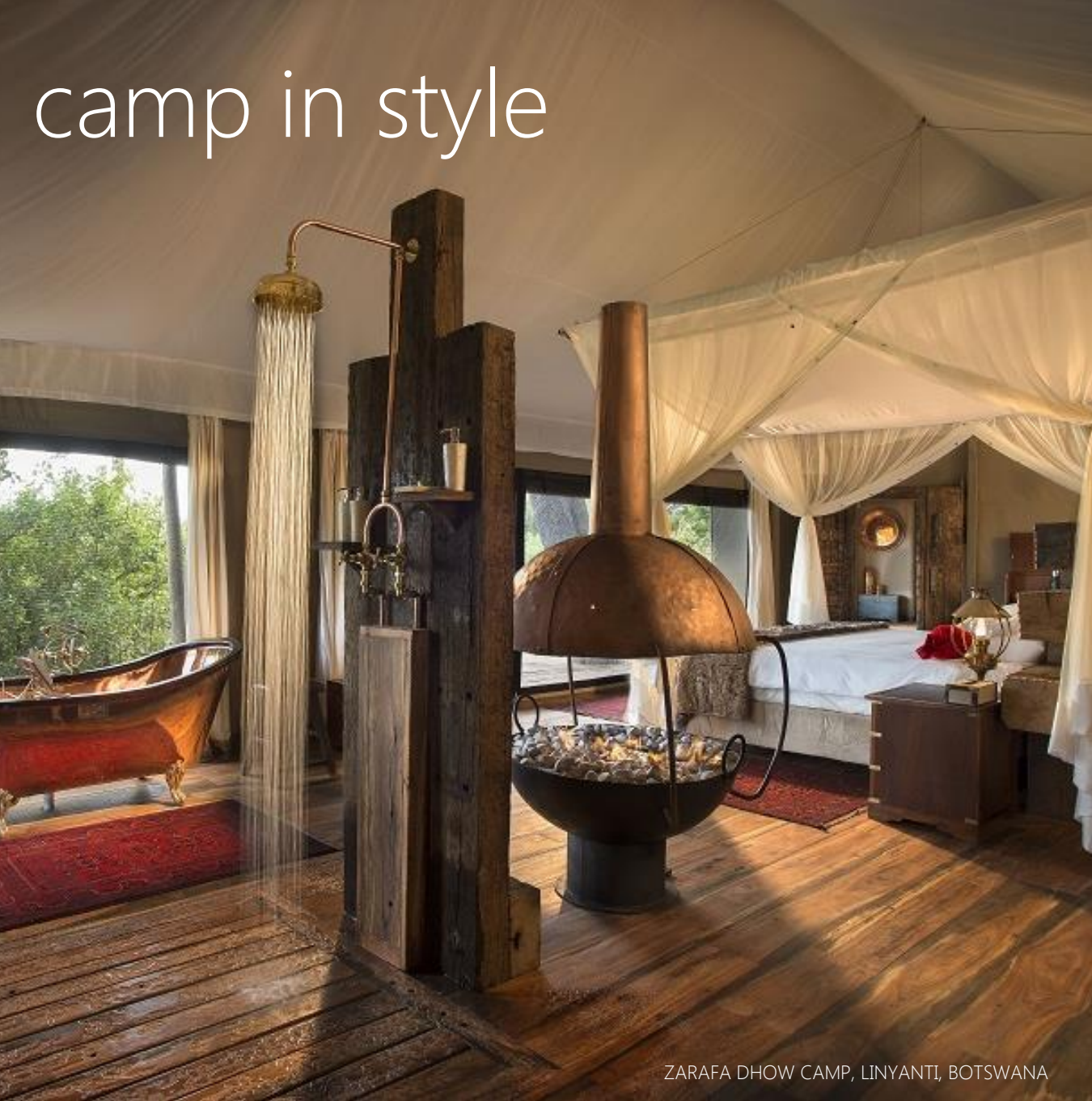
ZARAFA DHOW CAMP, LINYANTI, BOTSWANA