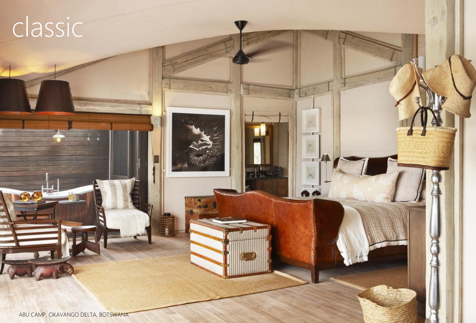
FA DHQABU CAMP, OKAVANGO DELTA, BOTSWANA