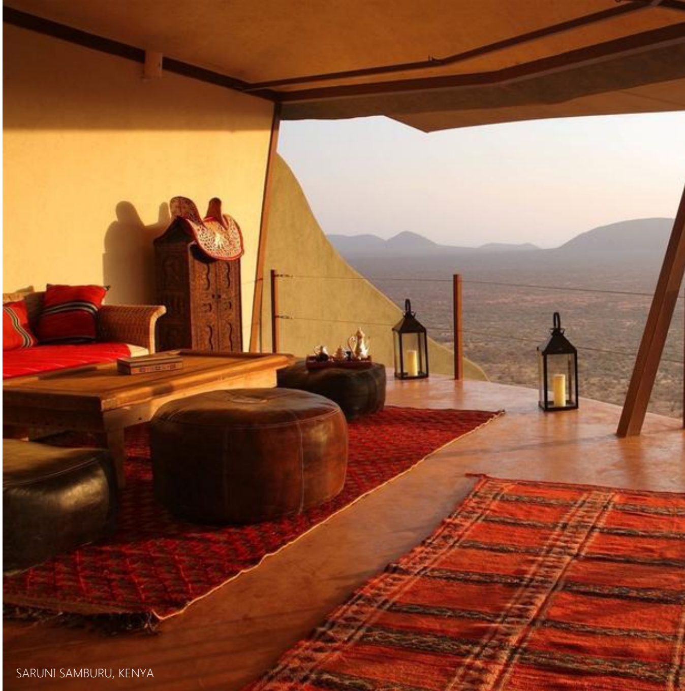
SARUNI SAMBURU, KENYA