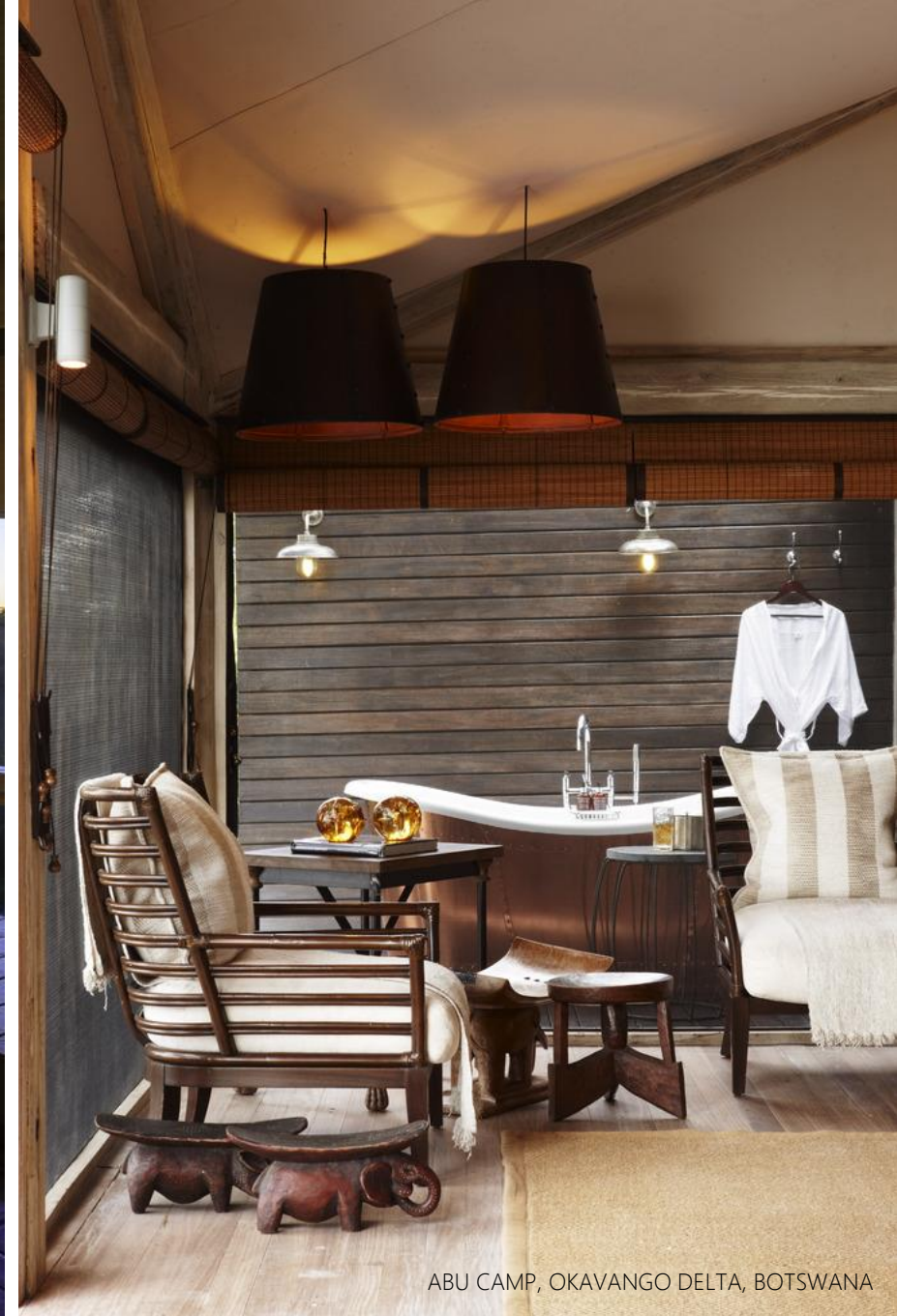
ABU CAMP, OKAVANGO DELTA, BOTSWANA