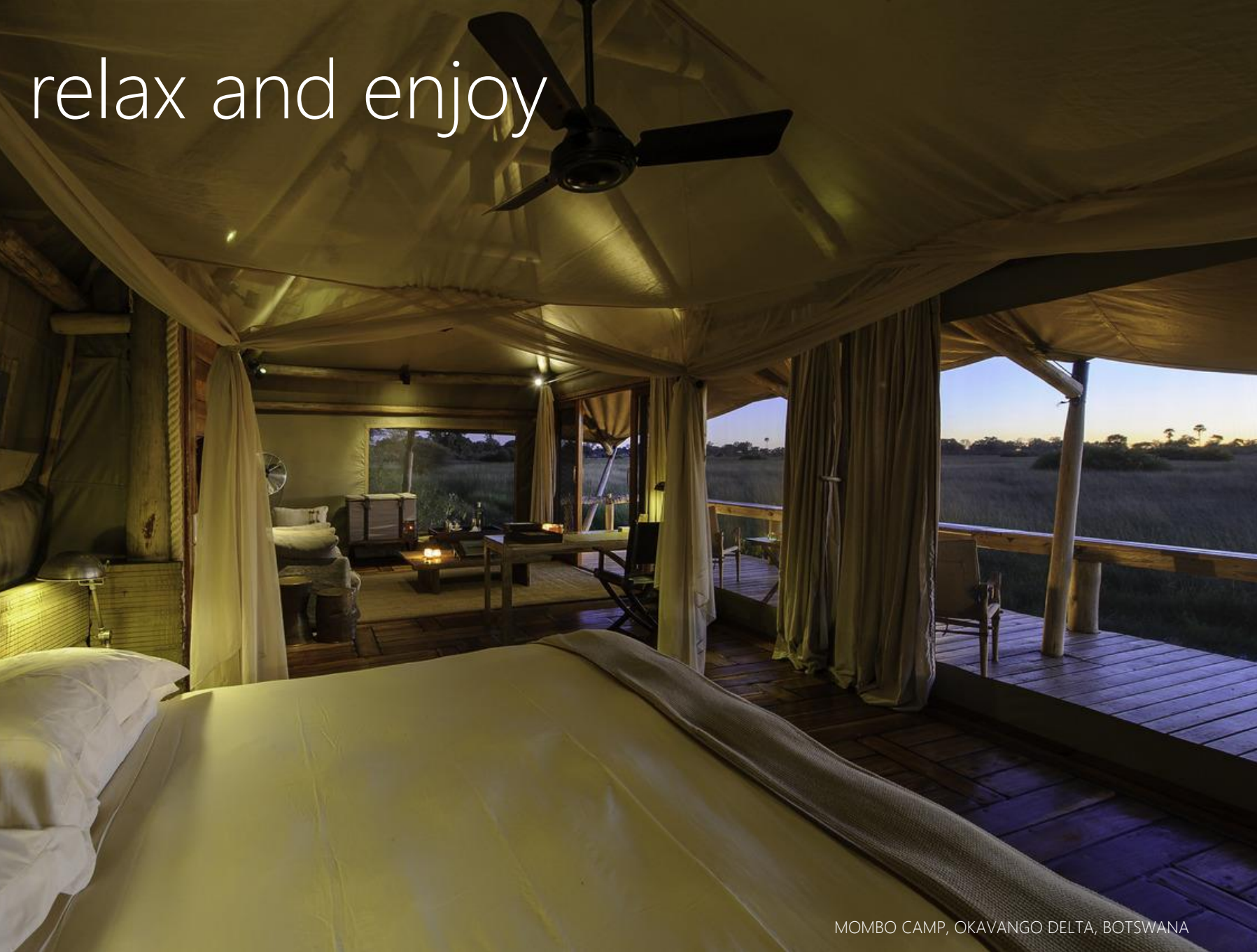
MOMBO CAMP, OKAVANGO DELTA, BOTSWANA